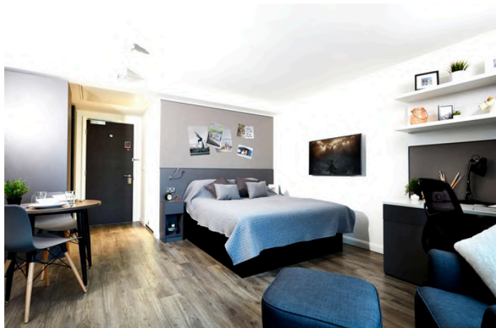
VITA Student Accommodation Manchester